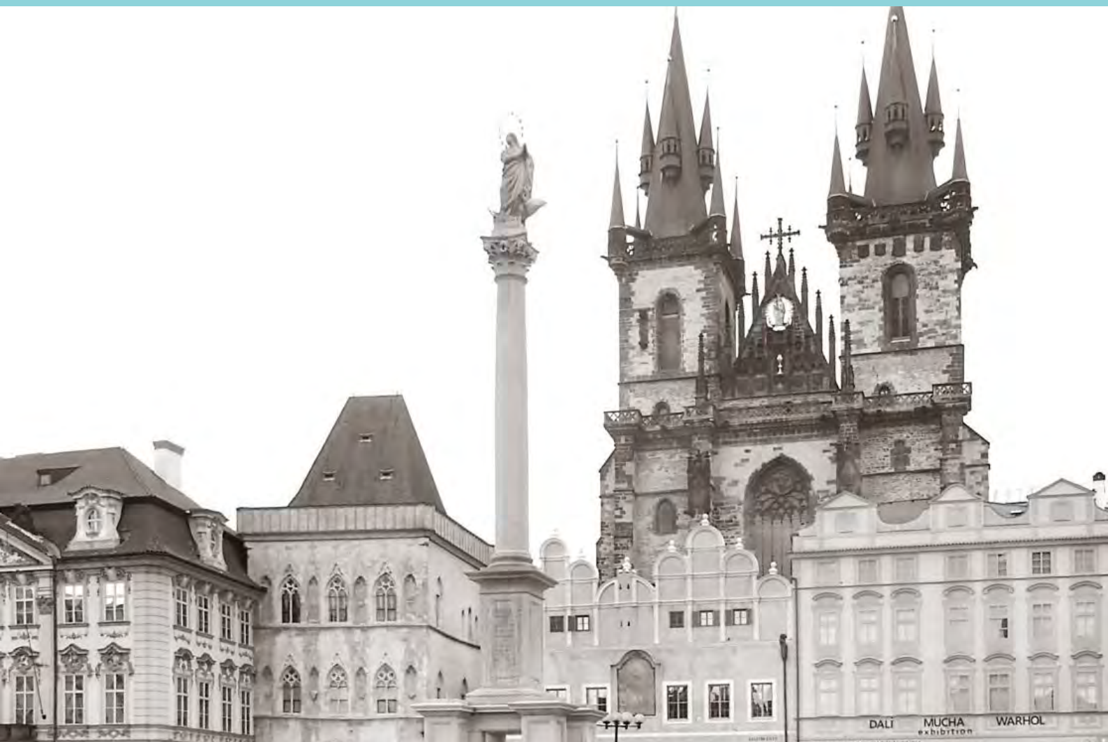
The new Marian Column in Prague on the Old Town Square, installed on 4 th June 2020.