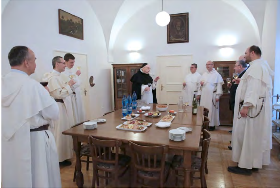
New refectory of the Dominican Priory of St. Giles.